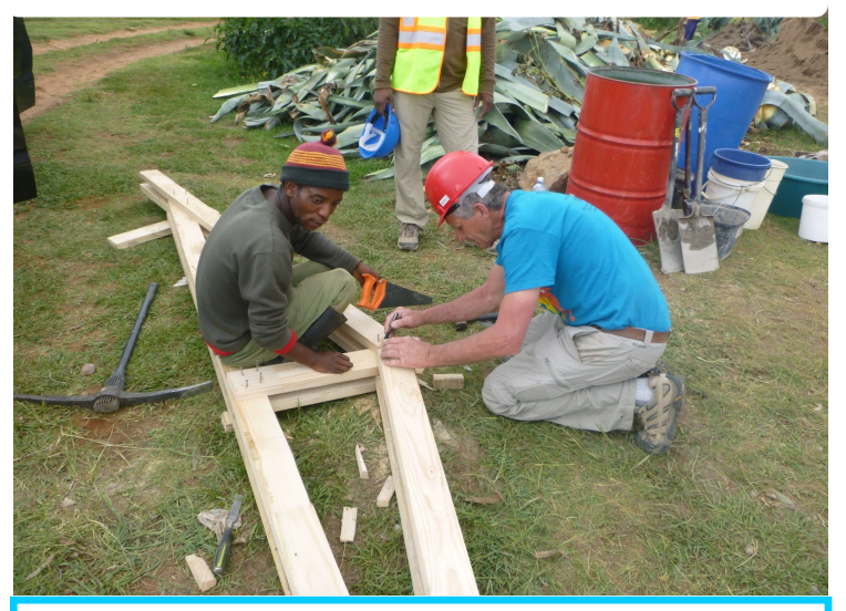
To read more about any of our GV trips please visit

Lesotho is classified as one of the least developed countries in the world. HIV and AIDS is an impediment to Lesotho's development as it exacerbates social ills. Adult prevalence rate is estimated at 25%. This in turn, leaves numbers of orphans and other vulnerable children in the country. 27.5% of children under age 18 are orphans. Habitat Lesotho's work in Lesotho encompasses new home construction, sanitation, training and capacity building. There is a new program in advocacy for enhancing access to decent and affordable places to call home with secure land tenure.